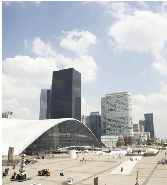
Paris La Défense Arena